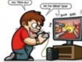
A Parent's Guide to Gaming