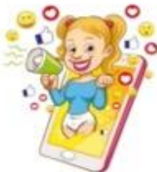
A Parent's Guide to Online Influencers